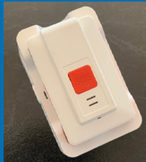
CHARGING DOCKING STATION