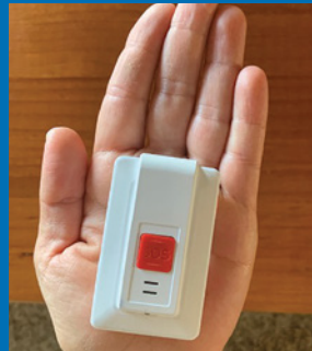
SMALL AND LIGHT WEIGHT